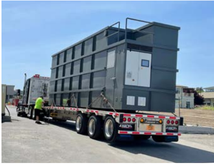
Pre-Engineered Packaged Systems

Our advanced wastewater treatment systems deliver efficiency, sustainability, and worry-free operation.